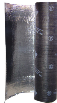
EshaRoof Reflect - Heavy weight, high reflectant undertile bituminous felt