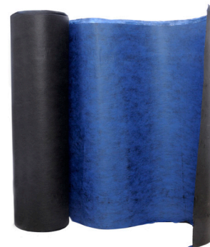
EshaRoof Felt - Light weight, high mechanical strength, semi-breathable undertile bituminous felt